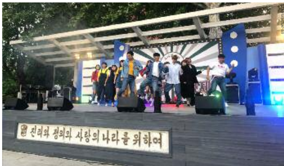
By Hyun Chea-lin KMG Cub Reporter

A festival for The College of Fine Arts and Artech College was held at Daemyung Campus May 14-15, 2019. The theme of this festival was that of a retro concept. The festival made old-fashioned style promotional posters and videos, and many students attended the event in retro costumes such as double denim fashion in line with the theme of retro. During these two days, there were activities such as a flea market, playing a game of memories such as jegi chagi. The